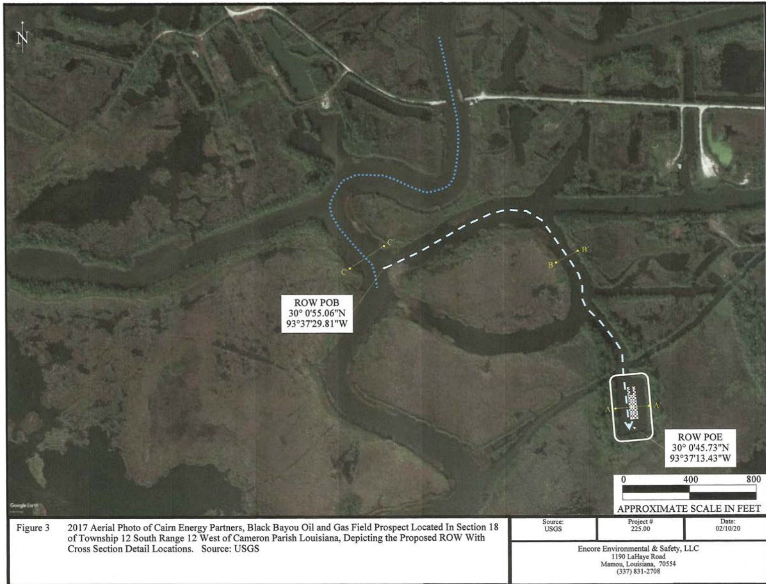
Figure 3 2017 Aerial Photo of Cairn Energy Partners, Black Bayou Oil and Gas Field Prospect Located In Section 18 of Township 12 South Range 12 West of Cameron Parish Louisiana, Depicting the Proposed ROW With Cross Section Detail Locations.